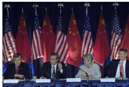
U.S. Secretary of Agriculture Mike Johanns, Commerce Secretary Carlos M. Gutierrez, Chinese Vice Premier Wu Yi, and U.S. Trade Representative Rob Portman at U.S.-China Joint Commission on Commerce and Trade press conference April 11 in Washington, DC.